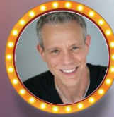
ADAM PASCAL (RENT)