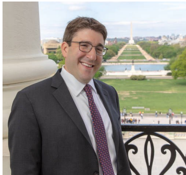
CBST Cantorial Intern 2009-10