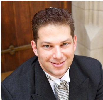
CBST Cantorial Intern 2004-05