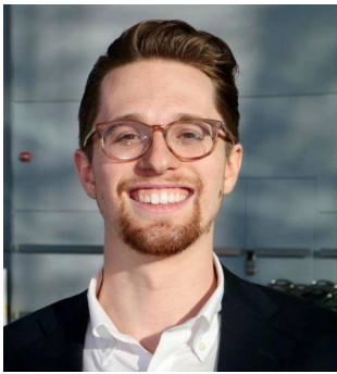
CBST Cantorial Intern 2020-21