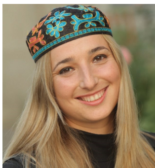
CBST Cantorial Intern 2010-2011