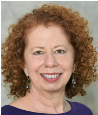
CBST Music Director since 1994