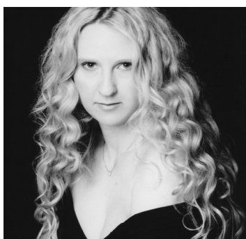
CBST Cantorial Soloist 2011-15